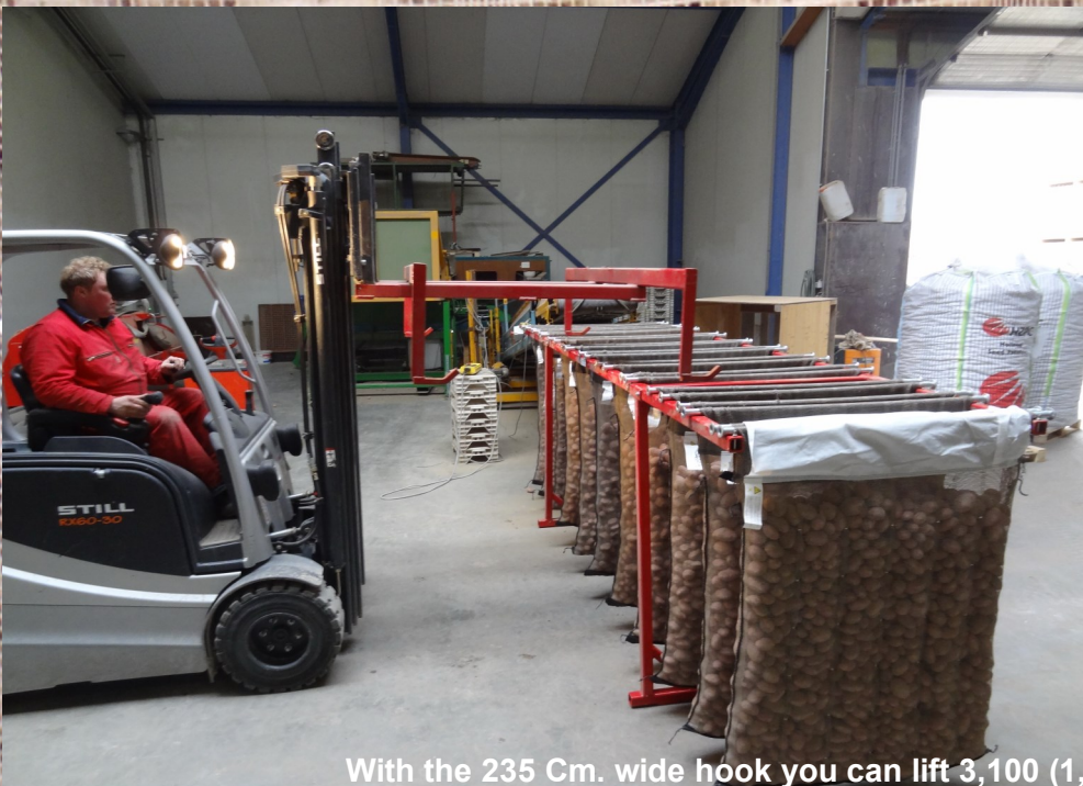
With the 235 Cm. wide hook you can lift 3,100 (1,400 Kg.) seedpotatoes