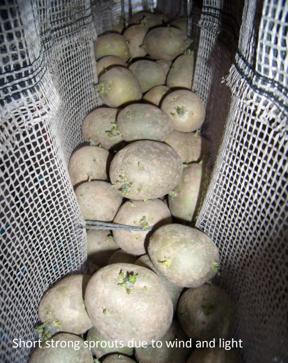
Short strong sprouts due to wind and light