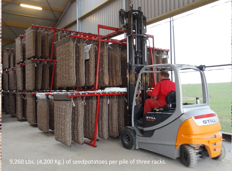
9,260 Lbs. (4,200 Kg.) of seedpotatoes per pile of three racks.