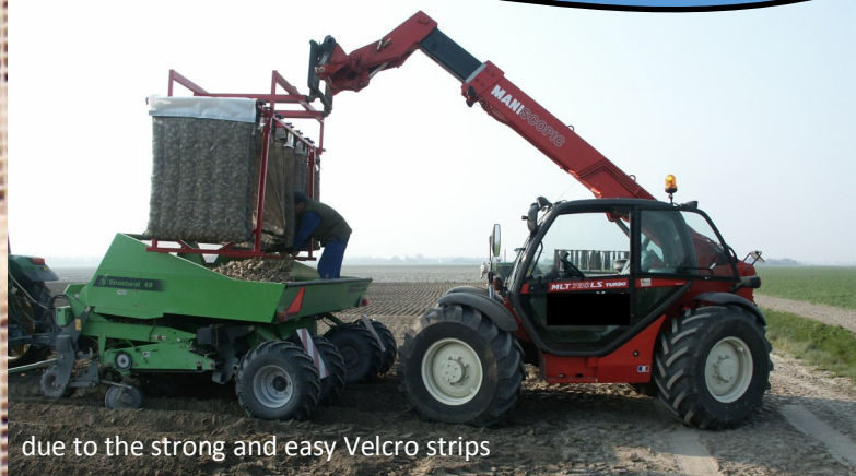
due to the strong and easy Velcro strips

30 years of experience , hundreds of users