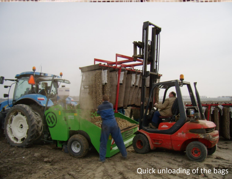
Quick unloading of the bags

30 years of experience , hundreds of users